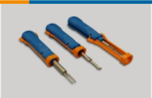
Insertion & Extraction Tools(12)