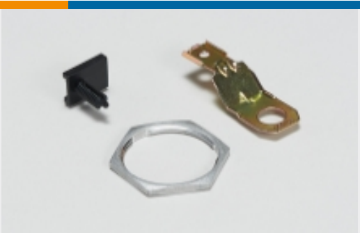
Other Automotive Connector Accessories(5)

DEUTSCH, TE Connectivity, and TE connectivity (logo) are trademarks.