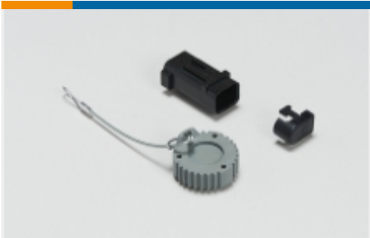
Automotive Connector Caps & Covers (12)

The Connector Selector is a reference guide to TE Connectivity's (TE) Industrial & Commercial Transportation electrical connectors. English