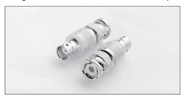
Figure 1: 7078-TRX-BNC 3-Slot Triaxial to BNC adapter

The Model 7078-TRX-BNC is a male, three-slot triaxial to female BNC adapter. It can be used to connect BNC cables to equipment having female, three-lug triaxial connectors.