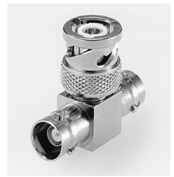
Figure 1: Model 237-TRX-T 3-Slot Triaxial Tee Adapter

The Model 237-TRX-T is a 3-slot male triaxial to dual 3-lug female tee adapter. You can use the 237-TRX-T adapter to connect multiple inputs to SMUs and electrometers. It also allows connection of external feedback elements to electrometers.